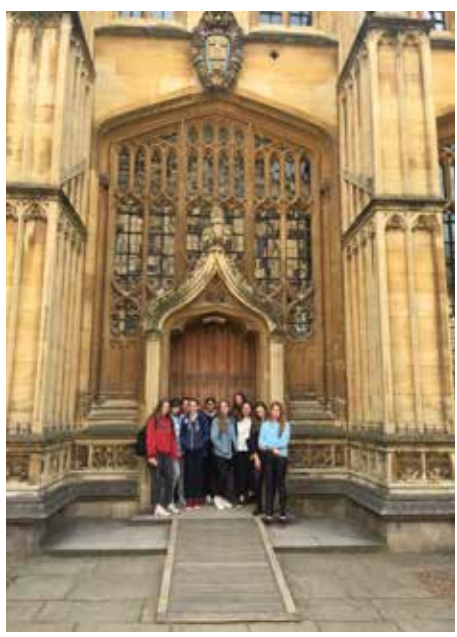
The students sat through 3 taster lectures. In Geography they learnt about water wars, in Zoology it was about evolution and in Ancient Languages they learnt about Lucretius.

It was a busy day in Oxford and one that I hope has benefitted our students. Comments from the students include: