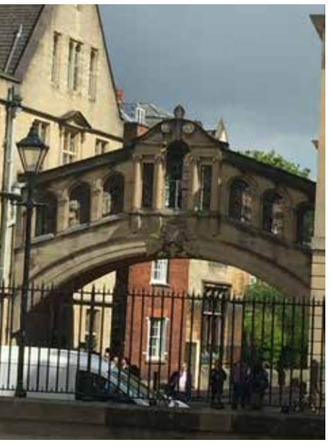
'Bridge of Sighs' which is a skyway joining two parts of Hertford College over New College Lane and is a replica of the famous 'Bridge of Sighs' in Venice.