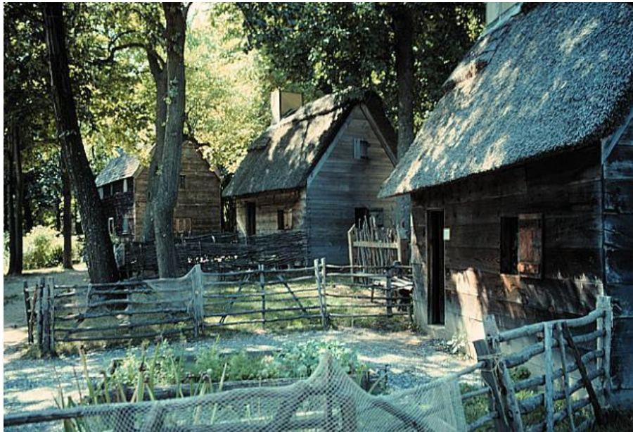
C. The type of houses new colonists would have lived in around 1620