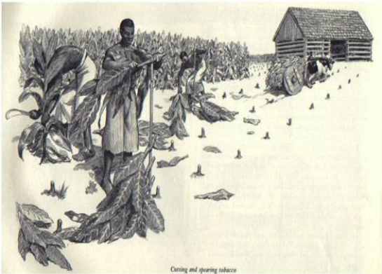
A. Slaves harvesting tobacco