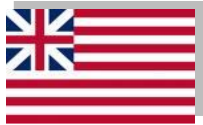
The Grand Union Flag. This was Flag of the British Empire in America

Read the information and do further research in order to complete the Tasks at the bottom of the sheet.