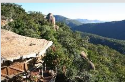
Open this content