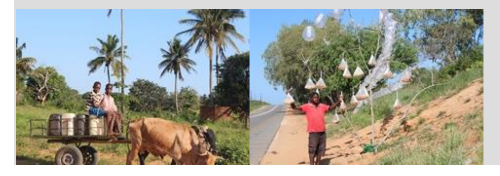
Jul 20 - Jul 21, 2021

As the scenery whistles past the window you can expect to see everything from coconut palms to towering granite mountains, children herding goats, people meandering on bicycles laden with charcoal on their way to market and roadside stalls piled high with fruit and vegetables.