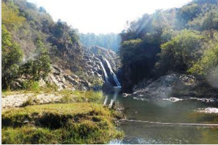
Jul 7 - Jul 9, 2021

Trekking phase - Ngwempisi Gorge. The trekking phase of your expedition will be an exploration of the Ngwempisi Gorge - an impressive 500m deep rugged granite gorge in southern Swaziland.