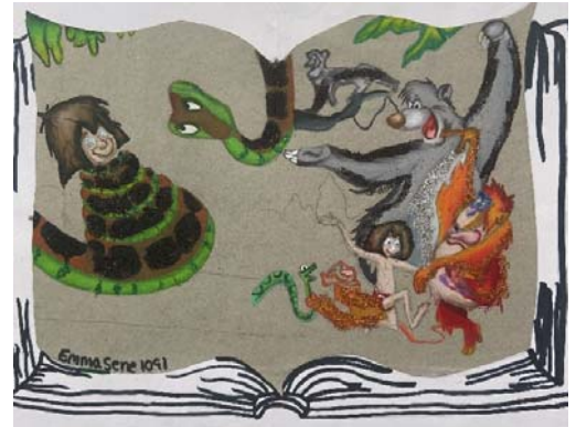
3 rd Emma Sene 10g1