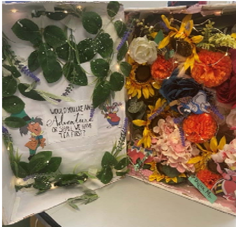
1 st Nicole Czaplá 9g2

We enjoyed a wonderful celebration of the Annual 25 th World Book Day last week. We celebrated authors, illustrators, books and, most importantly, a celebration of reading. In fact, World Book Day is the biggest celebration of its kind, designed by UNESCO as a worldwide celebration of books and reading and is marked in over 100 countries all over the world. Thank you to everyone who donated books – we received 660 books! We took part in various activities including a literacy themed art competition. The following students have been awarded book tokens for their wonderful art work;